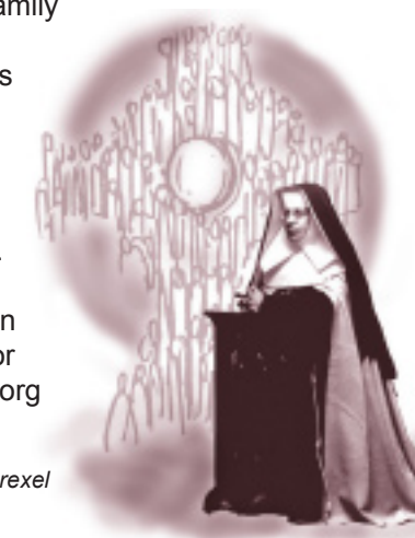
St. Katharine Drexel

Catholic Charities is happy to report that the Saint Katharine Drexel Education Program is in full swing! This new program offers classes five days a week, including evenings and Saturday mornings. Some of the classes include: Intro to Computers, Excel/Word/PowerPoint, GED preparation, resumé writing, interviewing skills, conducting a job search, car seat workshops, Natural Family Planning, English as a Second Language, Smoking Awareness and numerous parenting classes. The Education Program has 18 instructors, most of whom are volunteers. Classes are open to the public. For more information, please contact Taina Wilson, Education Coordinator, at 918.508.7108 or twilson@catholiccharitiestulsa.org