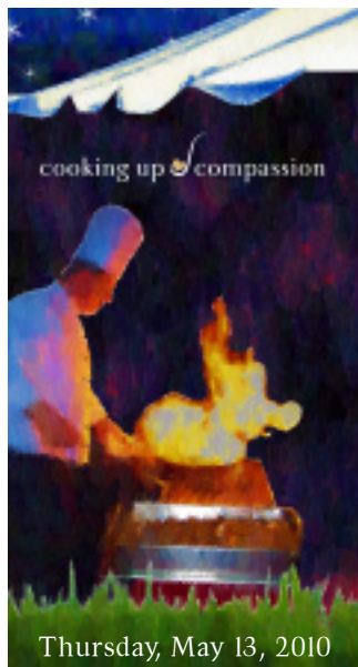
Thursday, May 13, 2010