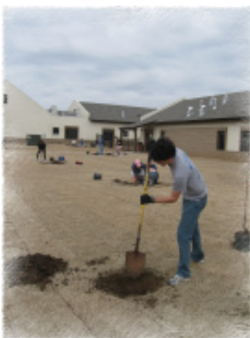
Up With Trees donated 155 trees for our new campus through a grant from the Apache Foundation

Catholic Charities was blessed to have a group who literally "dug in" from the moment they arrived. Digging holes, prepping the soil, carrying trees, replacing sod and mulching the finished product were the actions for the day. Though no one had tree planting experience, they were quick learners and did an outstanding job for us. We thank them for making our campus more beautiful and welcoming to those we serve.